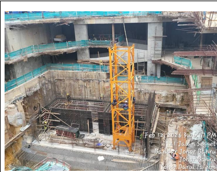
Tower Crane 2 nd and 3 rd mast erected