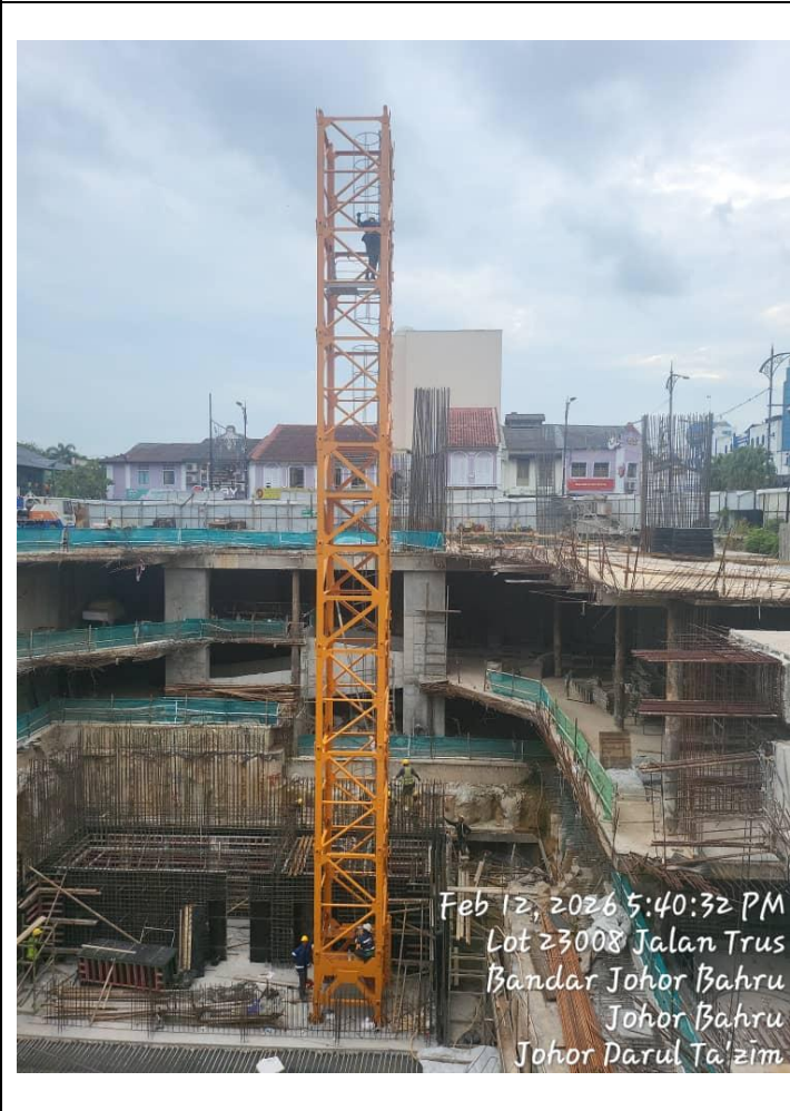
Done installing Tower Crane mast