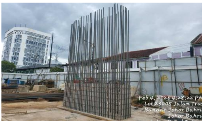
SW3 Rebars Installation