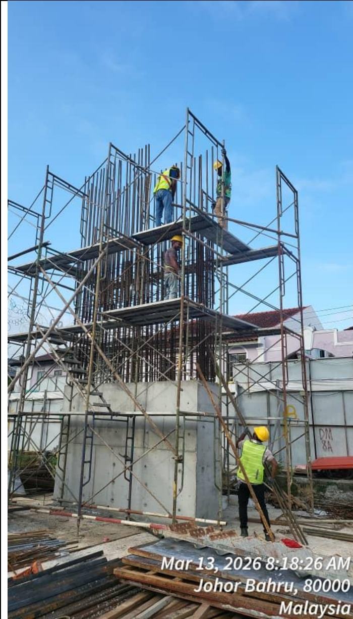
Barbending works for 2nd casting